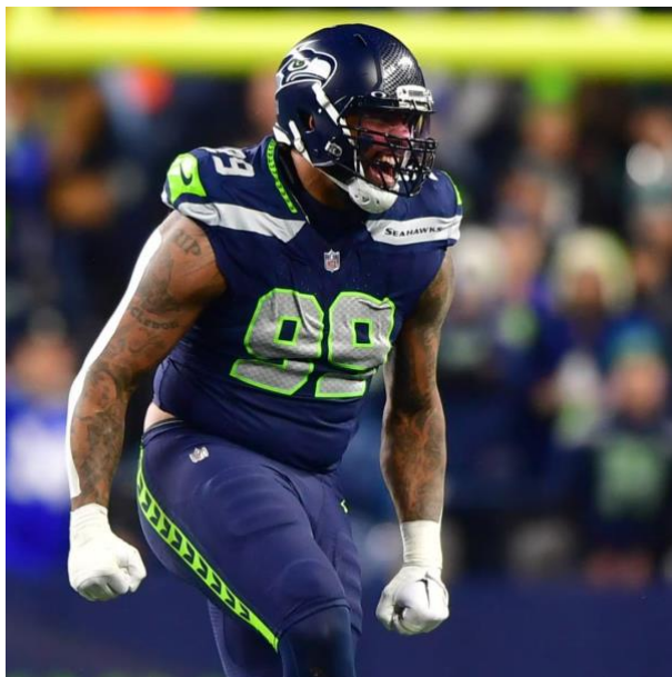
Leonard Williams #99

Beyond the line, head coach Mike Macdonald has offensive firepower at his disposal. Quarterback Sam Darnold is fresh off winning the NFL's Most Improved Player award . Kenneth Walker III and Zach Charbonnet form a balanced backfield, and the receiving corps features Jaxon Smith-Njigba, Cooper Kupp and rookie tight end Elijah Arroyo.