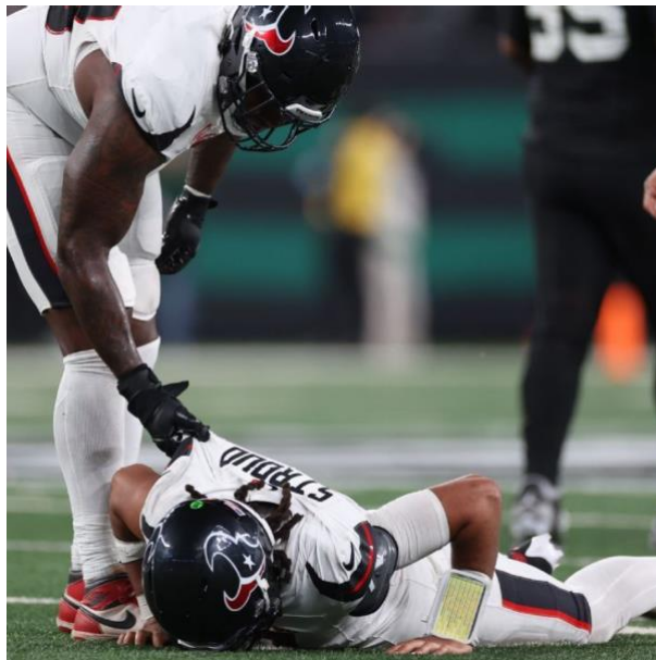
CJ Stroud #7

Do not be fooled: this offensive line will squander the success of the Texans this year. Analysts predict the Texans to win the division this year, but I'm not so sure. Per Pro Football Reference, the Texans were first in hurries, second in pressures, third in sacks and 24 th in hits.