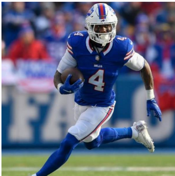
James Cook #4