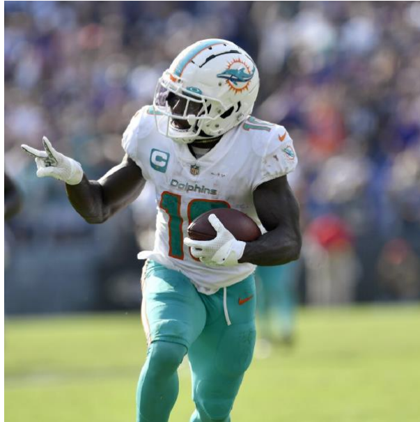
Tyreek Hill #10

The retirement of offensive tackle Terron Armstead leaves the Dolphins without their most reliable lineman. In 2024, Miami ranked last in pocket time and seventh in fumbles lost, despite facing the fewest blitzes. The front office passed on help like offensive lineman Grey Zabel, opting to add defensive end Kenneth Grant, leaving glaring holes up front.