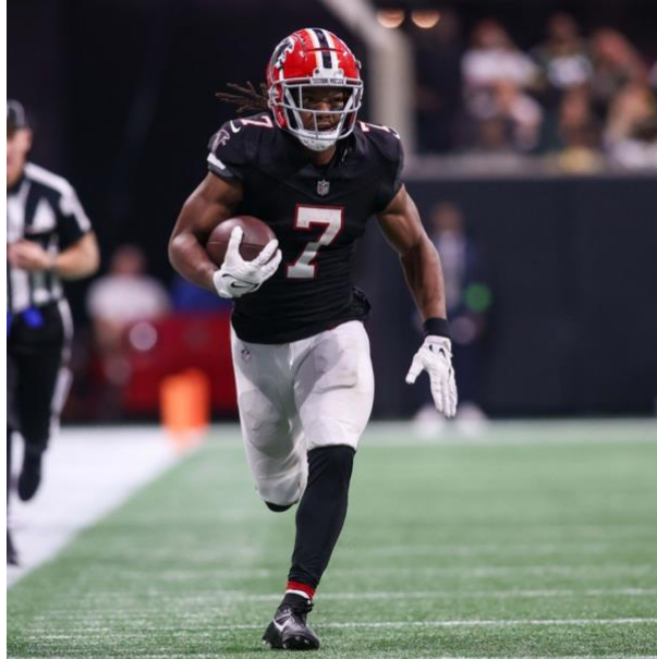
Bijan Robinson #7

Lindstrom, the league's highest -graded guard in 2024, and veteran left tackle Jake Matthews, who was top seven in pass blocking for all tackles. Left guard Matthew Bergeron showed notable improvement in his second season, with PFF highlighting his potential to break into the top 10 at his position.