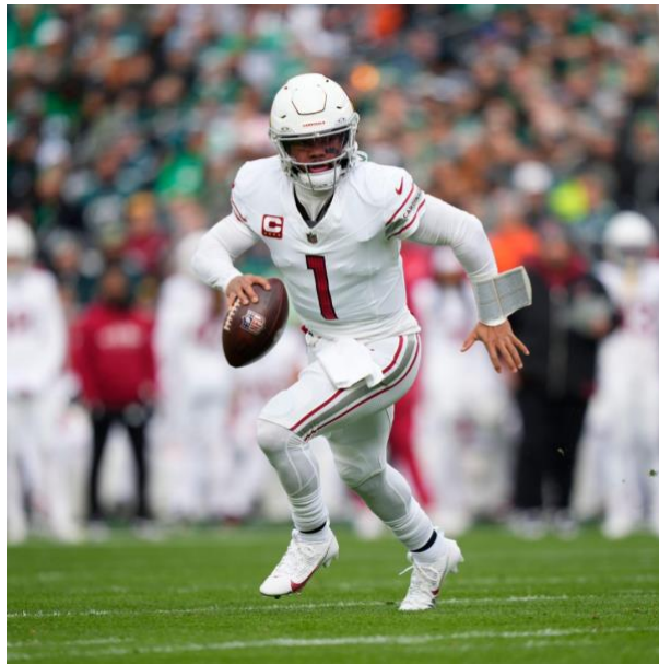
Kyler Murray #1

Unlike the Panthers, the problem is more about the offence than the defence. Arizona missed the playoffs eight out of nine years — and I don't expect this year to be any different. Last year, former first overall pick quarterback Kyler Murray threw 13 touchdowns to 11 interceptions — with seven of those touchdowns coming from two games. Since entering the league, Murray ranks twelfth in passing yards but only fifteenth in TDs, on top of being one of the most-sacked quarterbacks. Going into 2025, Murray has the fourth-highest cap hit in the NFL — more than Josh Allen or Patrick Mahomes.